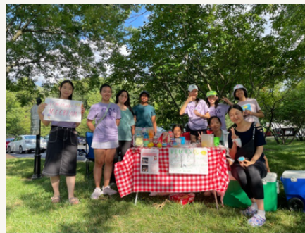
@indy.integirls hosted a bake sale on July 30.

Since its founding, INTEGIRLS has strived to help diminish the gender-based disparities seen in STEM across the globe. A grassroots organization first started by a few hard-working girls in Washington D.C., INTEGIRLS has since expanded to represent something beyond its original expectations, and it continues to do so today with the help of inspiring teens worldwide. Each chapter hosts biannual math competitions and periodic virtual puzzle hunts for girls and non-binary students affected by (trans)misogyny, using team-based problem solving to encourage contestants to work together to solve difficult problems. As of this year, we have over 20 chapters and 120 members, and these numbers continue to grow as people start new chapters and broaden chapter scopes. Our INTEGIRLS-adjacent competition participant community continues to swell, with 2,200+ students participating in the previous fall and spring competitions. This year, we have also grown our executive team: we now have a sponsorship ma-