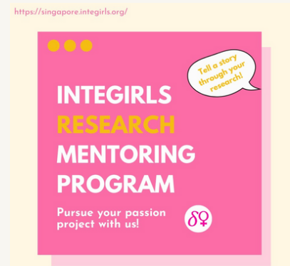
@integirls.singapore launches a mentorship program with mentors from the National University of Singapore.