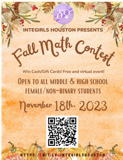
Houston competition flyer.

~HOUSTON ASKED TO BE MENTIONED IN THIS NEWSLETTER~